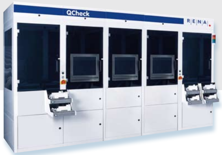
Front view QCheck